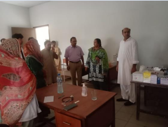
Mobile Medical camp for IDPs at Cambridge School Golarchi