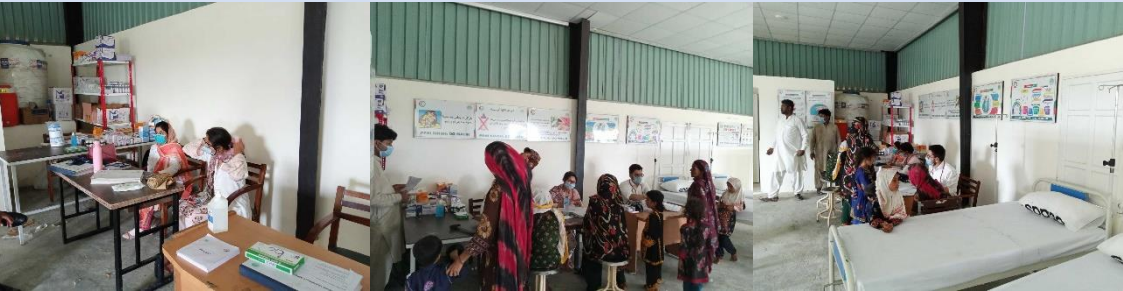
Evacuation Camp at Tsunami Evacuation Centre at Chashma Goth, Malir