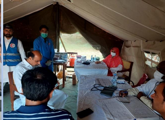
Mobile Medical camp for IDPs at Govt. High School Bhugra Memon