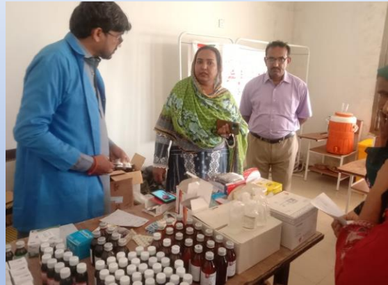
Mobile Medical camp for IDPs at Cambridge School Golarchi