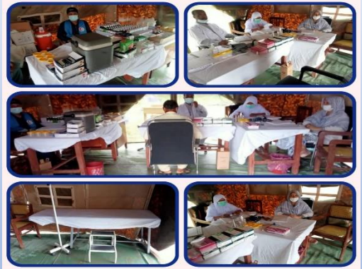
Medical Camp at Govt. Primary School Seerani