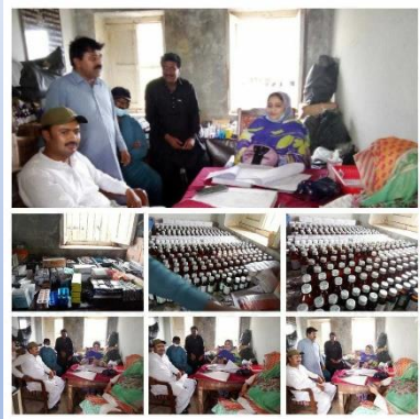
Mobile Medical camp for IDPs at Begna Mori