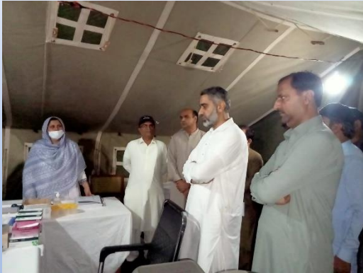
Medical Camp at Govt. Primary School Seerani