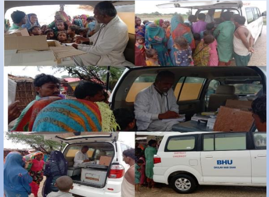
Mobile Medical camp for IDPs at Village Puncho Kolhi