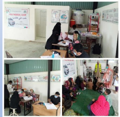
Mobile Medical camp for IDPs at Malir