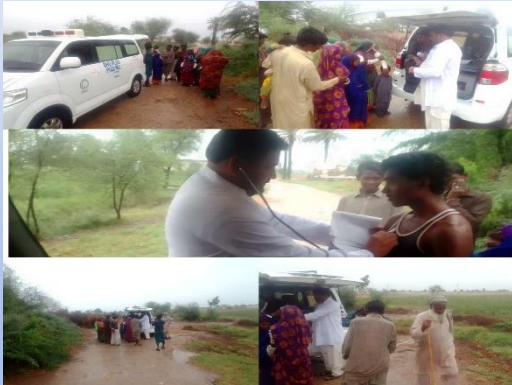
Mobile Medical camp for IDPs at Village Akram Panhwar