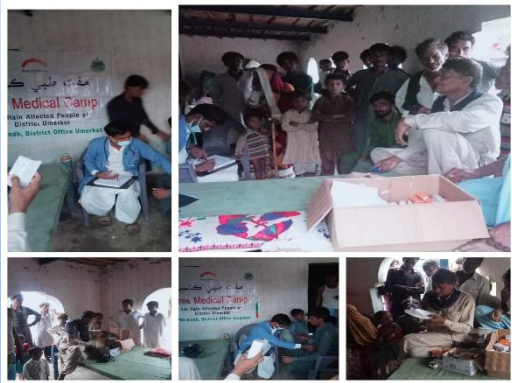
Mobile Medical camp for IDPs at Village Yaseen Memon