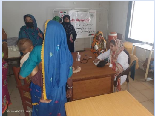
Mobile Medical camp for IDPs at Cambridge School Golarchi