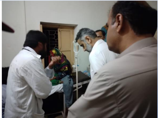
Mobile Medical camp for IDPs at Govt. High School Bhugra Memon