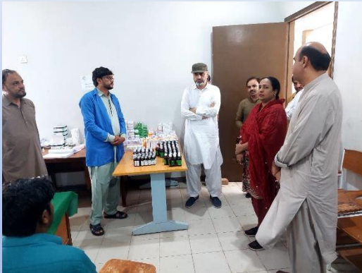
Mobile Medical camp for IDPs at Cambridge School Golarchi