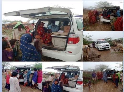
Mobile Medical camp for IDPs at Village Naseer Chandio