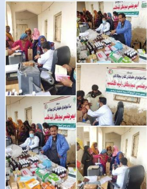
Free Medical camp for IDPs at Government Boys High School, Gharo