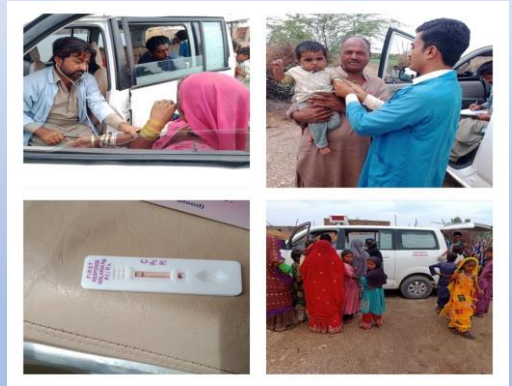
Mobile Medical camp for IDPs at Village Puncho Kolhi