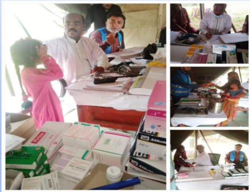
Medical Camp at Govt. Primary School Seerani