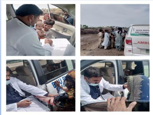
Mobile Medical camp for IDPs at Village Arif Khan Bhugari