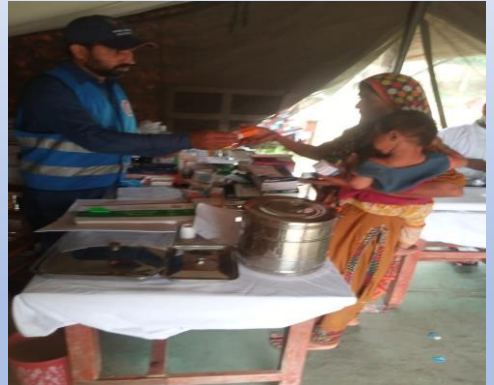
Medical Camp at Govt. Primary School Seerani