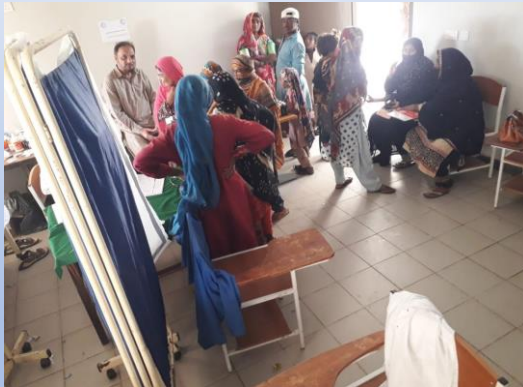
Mobile Medical camp for IDPs at Cambridge School Golarchi