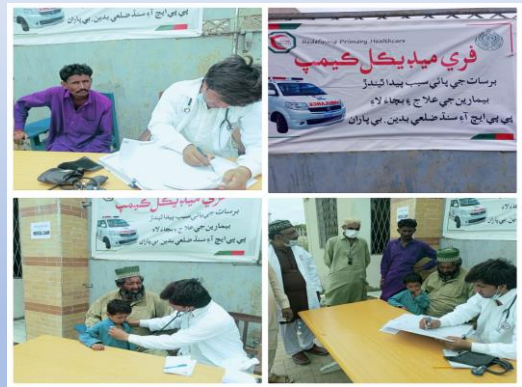
Mobile Medical camp for IDPs at Cambridge School Golarchi